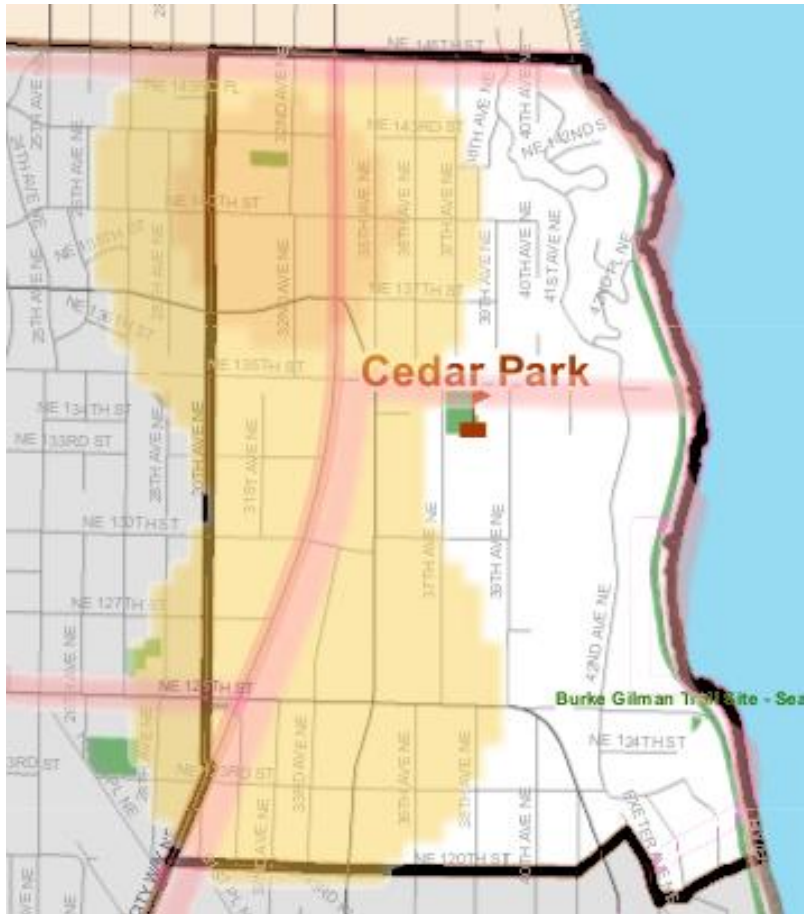
Cedar Park Attendance Area Overlaid with Elementary ELL Heat Map