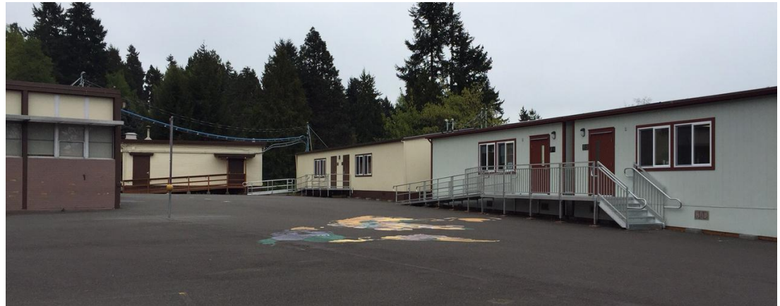
Portable classrooms at John Rogers Elementary

Grades 9-12 have grown by over 300 students